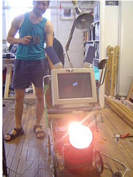
The Manchester version of the mimoSa machine, nearly finished.