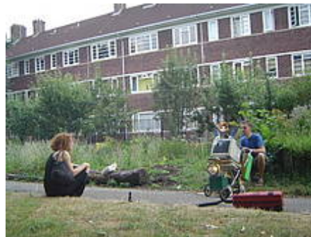
Manchester machine in action.