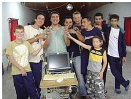
A happy mimoSa workshop in Farkadona, Greece.