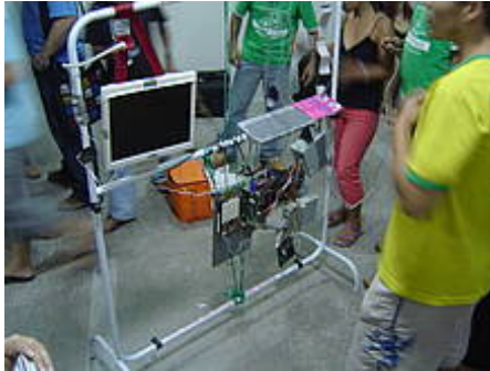
The version of the mimoSa machine created in Belem, Brazil.